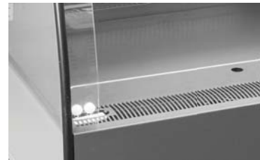
Energy saving trim kit