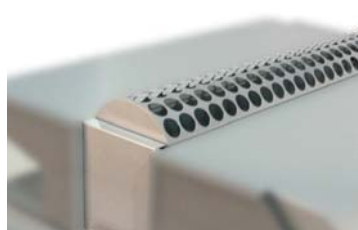
Back-to-back mounting kit