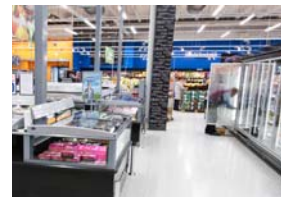
Creating more sales space for frozen products with Luxo.

By selecting Viessmann's Luxo freezers, the use of space in the shop was optimised enabling a much more open environment, thanks to larger aisles, and a contemporary feel. Timo Könttä quotes the strengths of Viessmann's cabinets as their display volume, energy efficiency and smart looks.